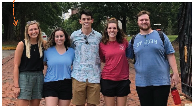
Local Outreach Team